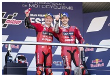
Download in hi-res