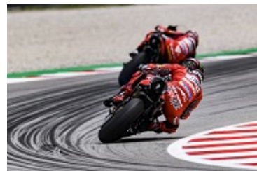
Download in hi-res