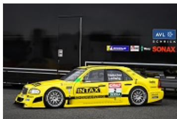
Download in hi-res