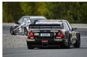
Download in hi-res