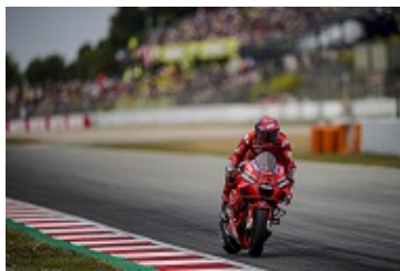
Download in hi-res