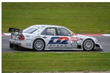
Download in hi-res