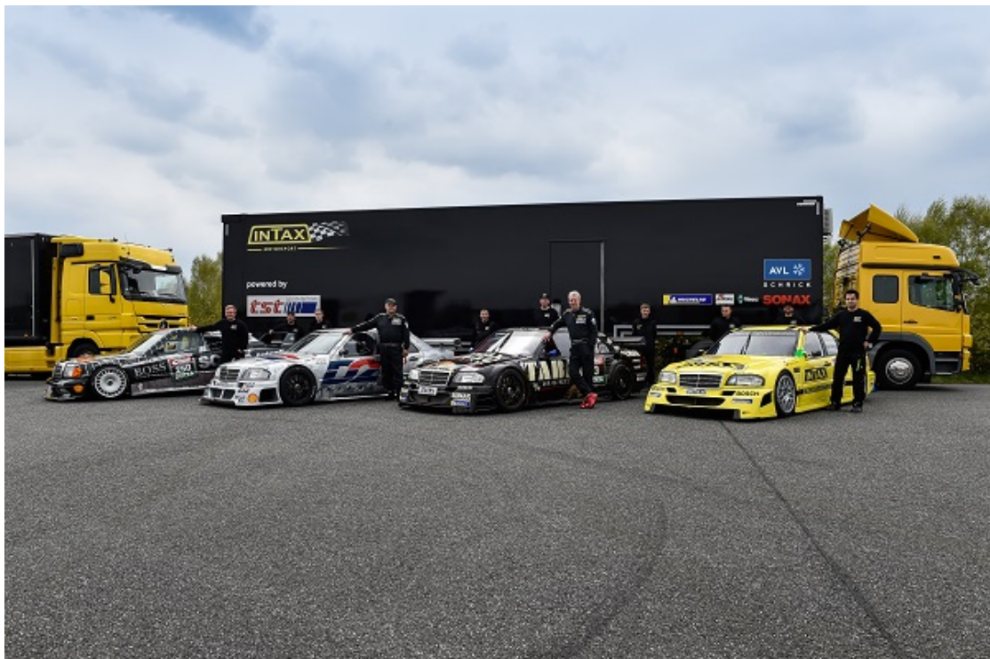
Download in hi-res